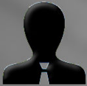
Sandeep Swain Secretary MBA Infrastructure Batch of 2013