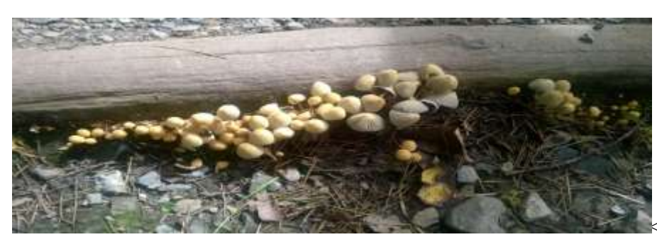
< Budding mushrooms

4 kms. Thus, this visit's input I felt was- "Good will" development and ultimately people's participation to implement a project/idea is most crucial for its success.